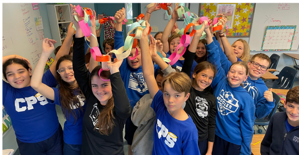
6th grade religion class learned about the Cardinal Virtue of Justice and Catholic Social Teachings by creating a Prayer Intention Chain!

We, the Catholic Community of Cathedral Parish School, will be examples of Christian teachings, will serve others as Jesus would, will achieve academic excellence, and put Christ first in ALL we do.