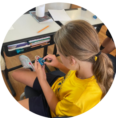
5th graders are getting ready for middle school by practicing opening locks!

Over just a few days, we go from celebrating the joy and innocence of childhood at our VPK Celebration to remembering our fallen heroes on Memorial Day. We have much to be thankful for on both fronts. We are deeply thankful for the sacrifices of those who allow us to live lives free from oppression and allow our children to be children— and we as adults to have carefree moments of joy as well!