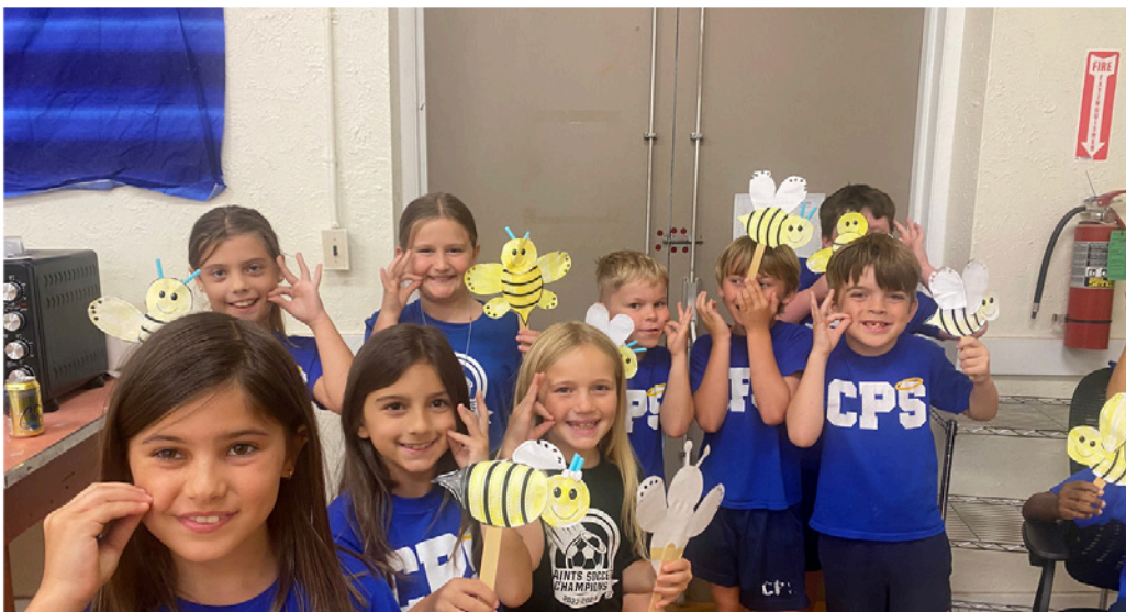
Students learned the sign for bumblebee and sang "Bringing Home a Baby Bumblebee" in ASL!

May 31st: Last Day of School - 11am Dismissal