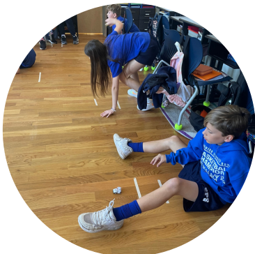
5th grade explored how mass affects mechanical energy using pullback cars!

With three weeks left until Easter weekend, how are we doing? Have we kept our Lenten promises? Have we made a greater commitment to prayer, fasting, and almsgiving? There is still plenty of time left to do something meaningful—may God be with You all on the journey!