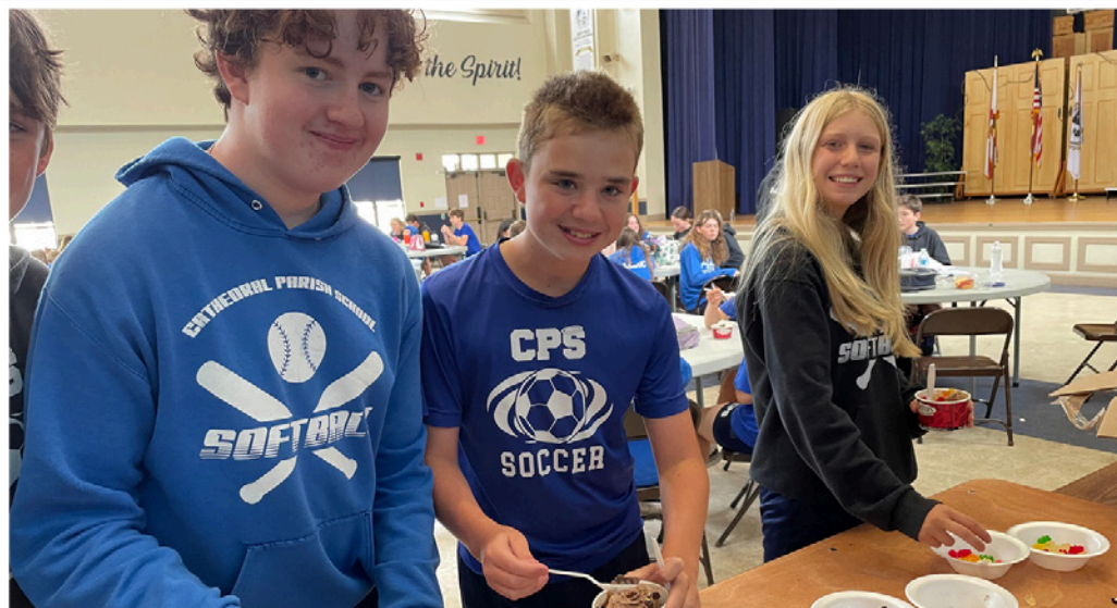
Middle school students earned ice cream sundaes for helping with VPK drop off all year!

We, the Catholic Community of Cathedral Parish School, will be examples of Christian teachings, will serve others as Jesus would, will achieve academic excellence, and put Christ first in ALL we do.