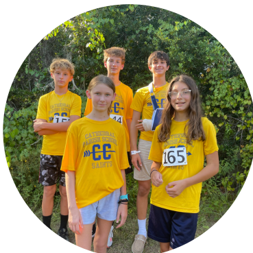
We enjoyed cheering on our Cross Country team at their first meet!

This Wednesday in Mass, we talked about how Jesus frequently went off by Himself to pray with God. On Friday, the 1st - 8th graders spent time in Adoration, experiencing sacred silence and learning how to listen to Jesus speaking within our thoughts and feelings. As parents, we are the first and most important teachers of the faith to our children. May we all lead by example by make daily quiet time with God a priority in our lives.