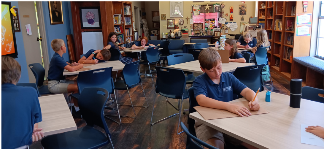
7th grade is working on scenic designs for our upcoming performance of Stone Soup the Musical!

We, the Catholic Community of Cathedral Parish School, will be examples of Christian teachings, will serve others as Jesus would, will achieve academic excellence, and put Christ first in ALL we do.