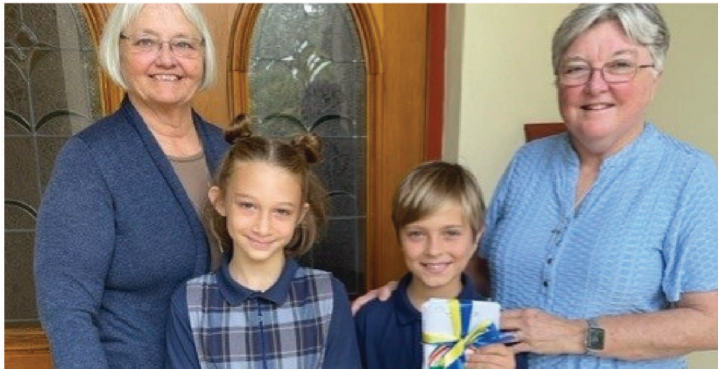
4th graders delivered their cards they created for the Sisters at their retreat!

We, the Catholic Community of Cathedral Parish School, will be examples of Christian teachings, will serve others as Jesus would, will achieve academic excellence, and put Christ first in ALL we do.