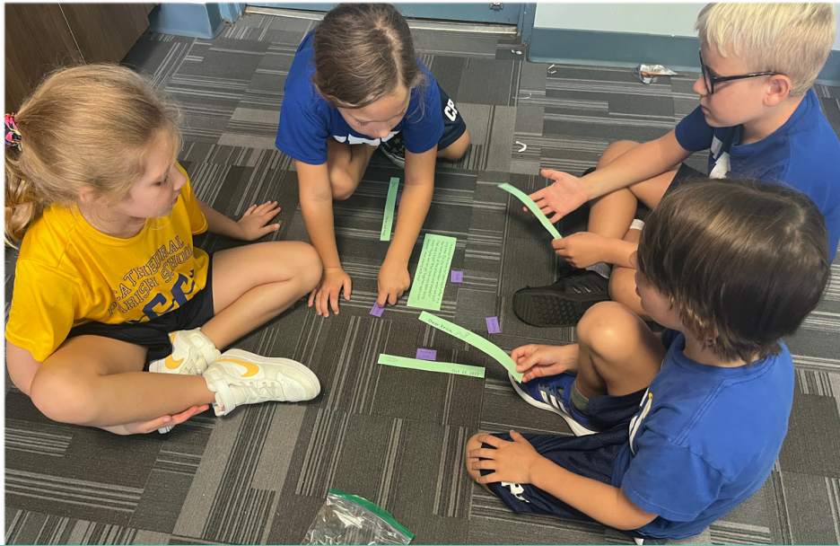
2nd grade worked together to order the parts of a friendly letter!

We, the Catholic Community of Cathedral Parish School, will be examples of Christian teachings, will serve others as Jesus would, will achieve academic excellence, and put Christ first in ALL we do.