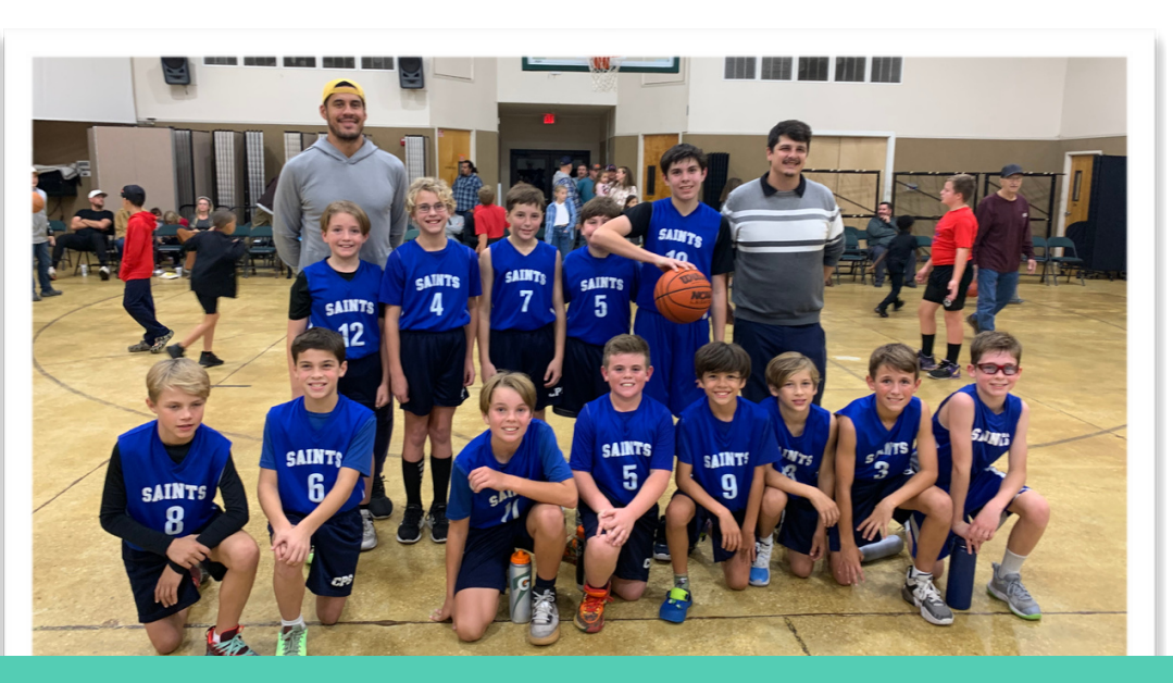
Congratulations to our JV basketball team on their semifinal playoff win!

We, the Catholic Community of Cathedral Parish School, will be examples of Christian teachings, will serve others as Jesus would, will achieve academic excellence, and put Christ first in ALL we do.