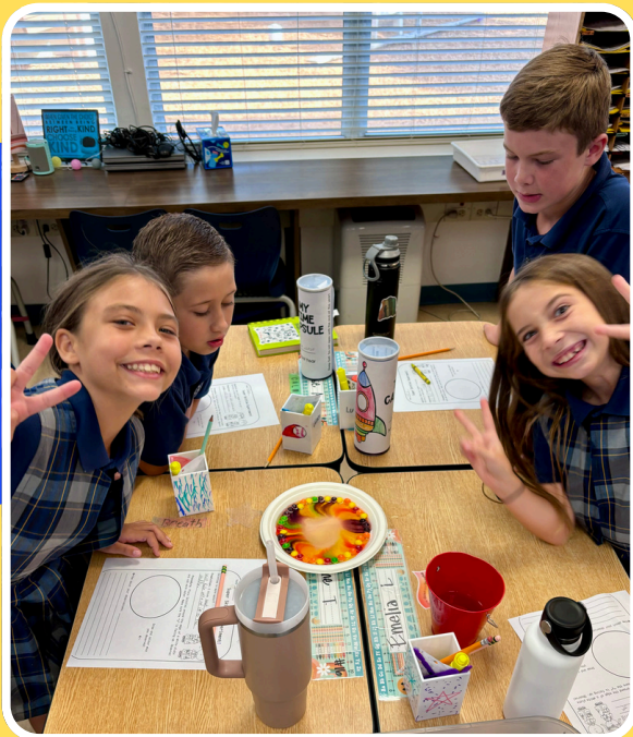
4th grade made predictions with a fun skittles experiment