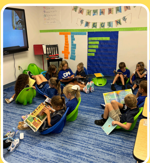
1st and 3rd grade reading buddies