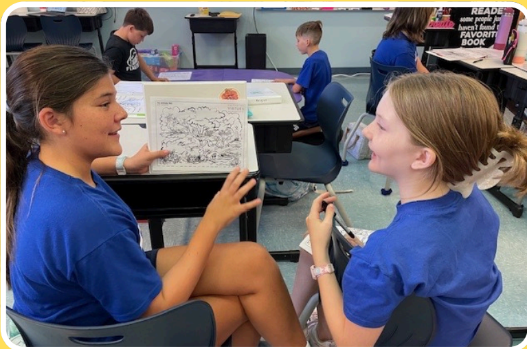
6th grade religion students discussing the Kerygma Tree they will be coloring throughout the year, while walking through salvation history.