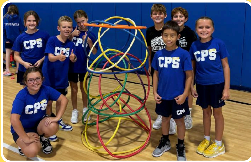
5th grade students completed a 3-tier Hula Hut at a stem station in PE

We, the Catholic Community of Cathedral Parish School, will be examples of Christian teachings, will serve others as Jesus would, will achieve academic excellence, and put Christ first in ALL we do.